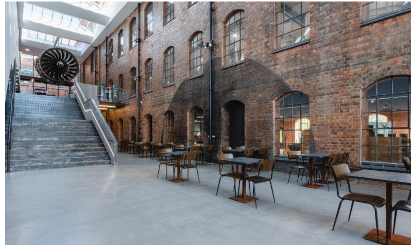
The IPI Model