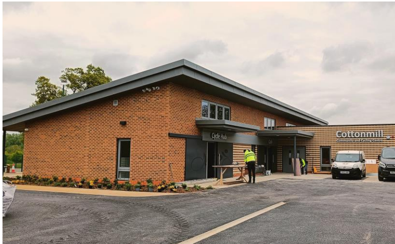
Cottonmill Community Centre

CONSTRUCTING EXCELLENCE HBCEC AWARDS 2022