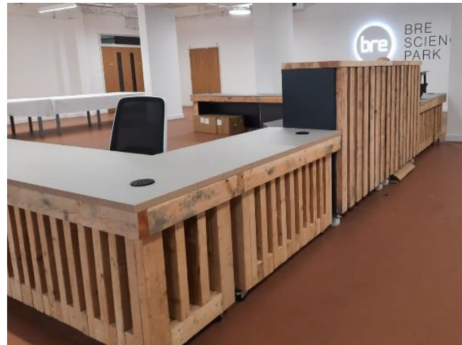
Building 17 #yeswecan