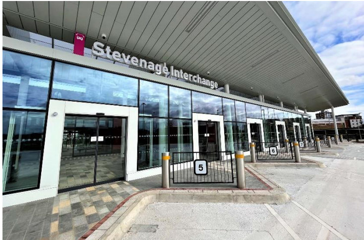
Stevenage Bus Station

CONSTRUCTING EXCELLENCE HBCEC AWARDS 2022